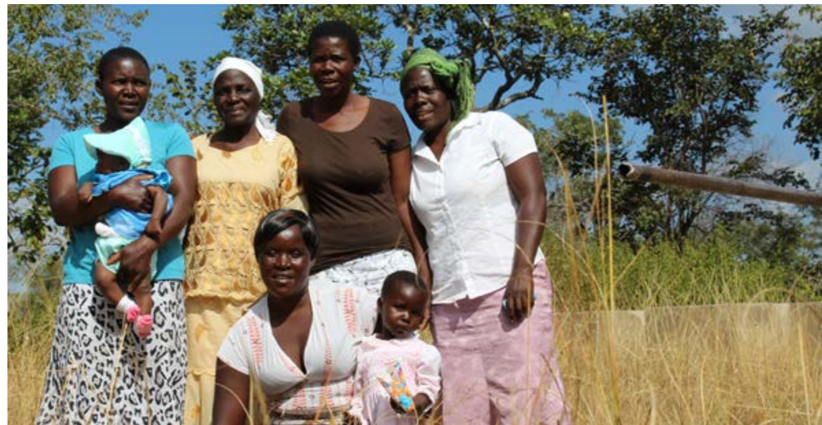
Kubatana loan group, MLF Zimbabwe

The Paul Foundation is a grant giving trust and social impact investor. Their generous grants were instrumental in launching MLF Zimbabwe operations and come to a total of £120,000. In 2022 they are providing a donation of £41,000 for operational expenses and loan book growth. In addition to this, they have also provided a social impact loan to MLF operations in Zambia.